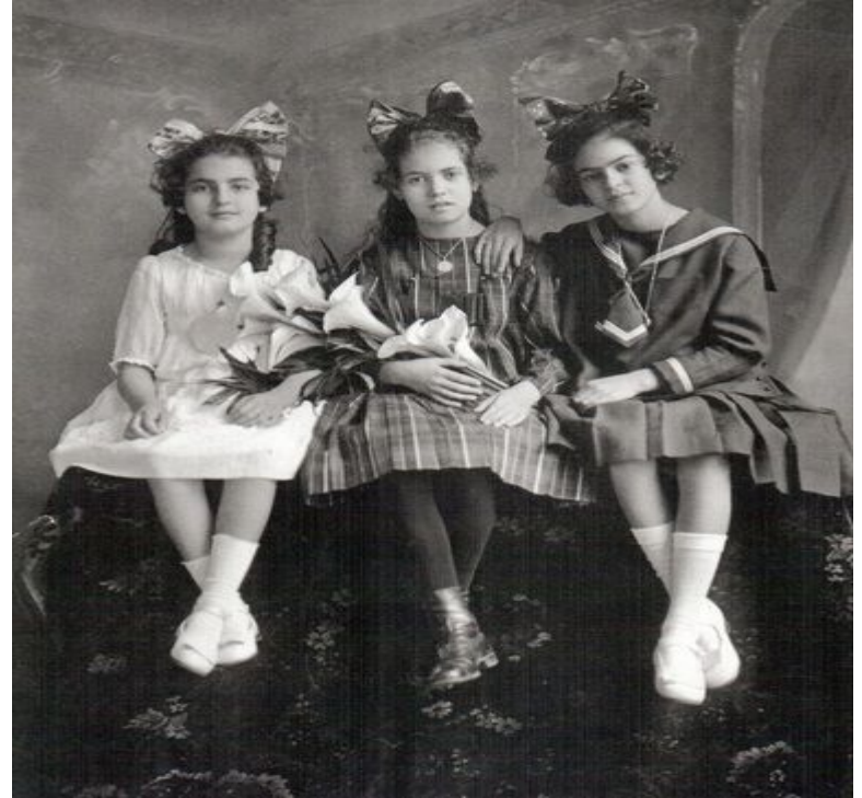
Kahlo and her sisters