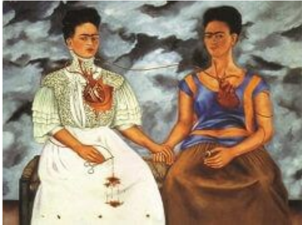
The Two Fridas, 1939

Despite her fame today, Kahlo sold few paintings in her lifetime. Her only solo exhibit took place the year before her death.