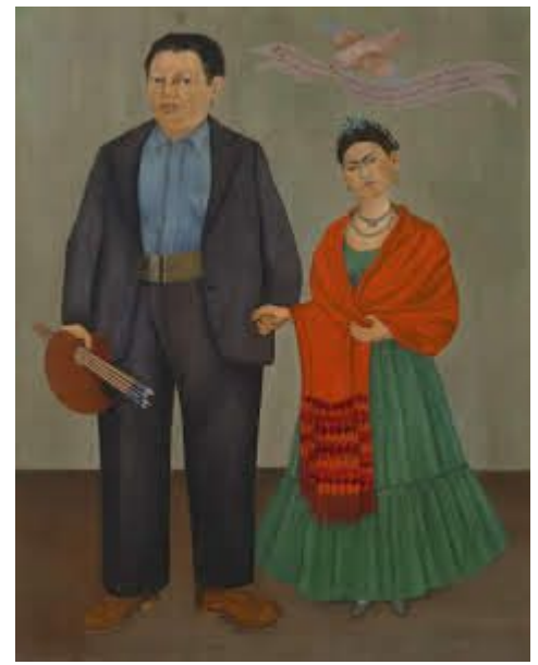
Frida and Diego Rivera 1931